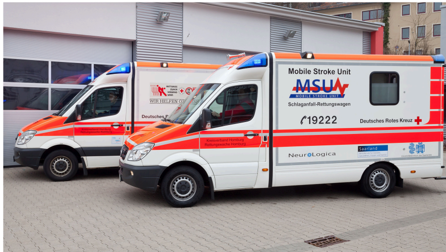
FIGURE 1 | Mobile Stroke Unit (MSU). The Mobile Stroke Unit is an ambulance which contains a multimodal CT scanner, a point-of-care laboratory, as well as a telemedicine system, which allows transfer of CT images and videos of patient examination for input from hospital specialists. Pictured is the MSU in Homburg, Germany.