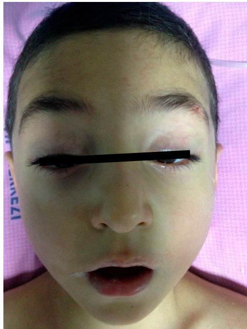
Figure 2. The appearance of bilateral facial paralysis in Case 2.

A six-year-old boy was brought to the emergency department with a complaint of difficulty walking after five days of an upper respiratory tract infection. On the physical examination, bilateral peripheral facial paralysis was seen (Figure 2). Muscle strength of bilateral limbs were 3/5, and arms were 4/5. Deep tendon reflexes on bilateral limbs were hypoactive.