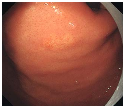
► Fig. 1 White light images of early gastric cancer (gastric adenocarcinoma of fundic-gland type). A 0-IIa lesion was located at the greater curvature of the fundus near the cardia. Pathological diagnosis: U, 0-IIa, 9x6 mm, gastric adenocarcinoma of fundic-gland type, pT1b/SM2 (600 µm), ULO, Ly0, V0, HM0, VM0.