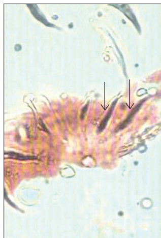
Figure 2: Photomicrograph (100X) of bone tissue showing scolex

An ultrasound of the abdomen was later performed and did not reveal hydatid cyst in the lung or the liver. The patient was treated with albendazole for three cycles at a dose of 400mg twice a day for four weeks followed by a two-week rest without therapy. 10,11 The patient was followed for one year with no recurrence of the lesion.