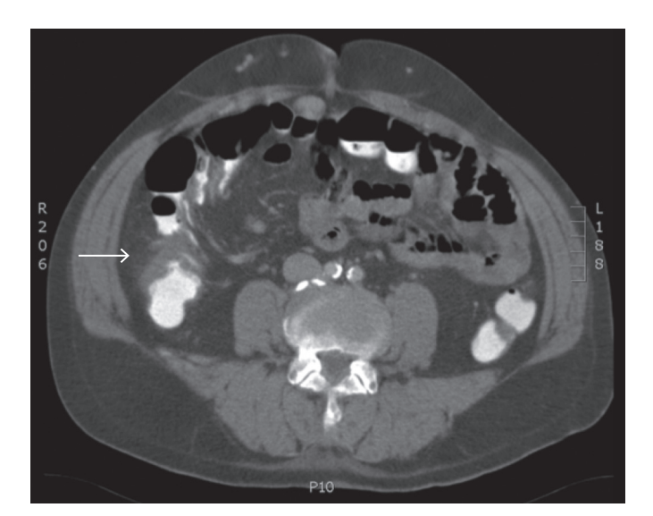
Figure 1. Enhanced computed tomography revealed segmental wall thickening in ascending colon (arrow).

Ingestion of a toothpick is a rare incident, and gastrointestinal (GI) perforation has been reported to occur in 0.2 per 100,000