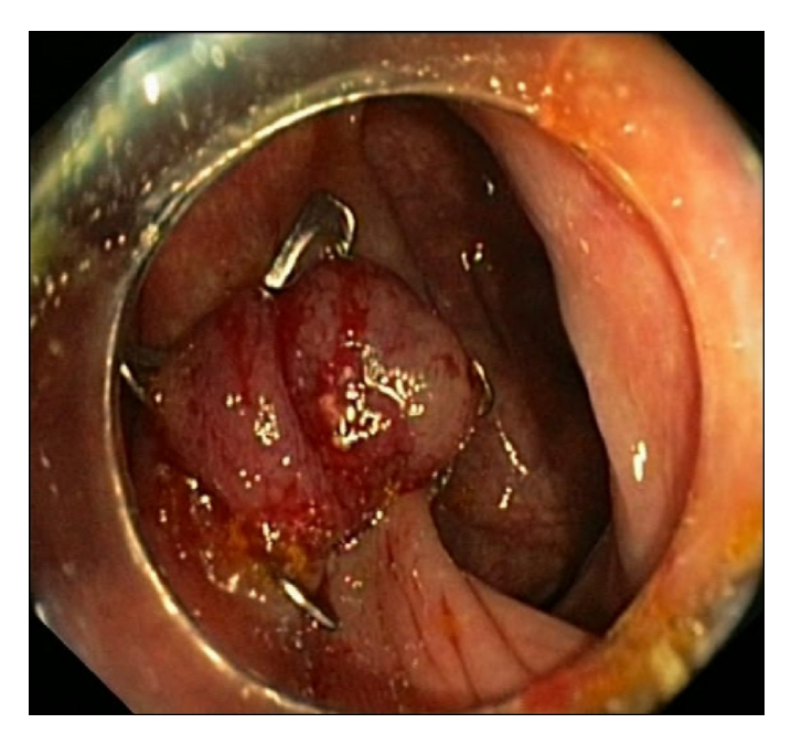
Figure 4. Endoscopic image of successful closure of the perforation site by an over-the-scope clip.

people every year in the United States.¹ Extremes of age, personality disorders, mental retardation, artificial dentures, palatal insensitivity, and alcoholism have been described as predisposing factors.² Diagnosis is difficult due to unspecific clinical findings, and toothpicks were apparent with imaging techniques in only 14% of cases.³ Most patients present with abdominal pain (70%), as our patient did.³ Definitive diagnosis of a toothpick injury is commonly made at laparotomy (53%) followed by endoscopy (19%).³ The most common sites of perforation are the