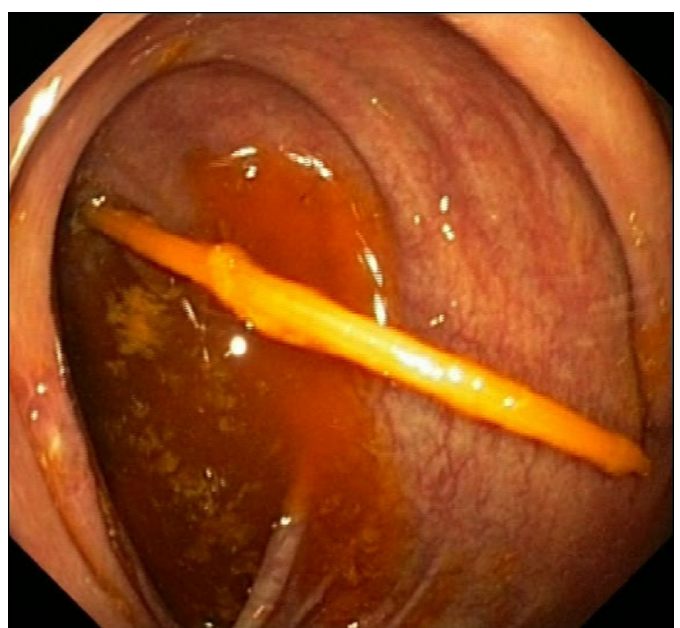
Figure 2. Colonoscopy showed a wooden toothpick impacted in the ascending colon.

ACG Case Rep J 2016;3(4):e165. doi:10.14309/crj.2016.138. Published online: November 23, 2016.