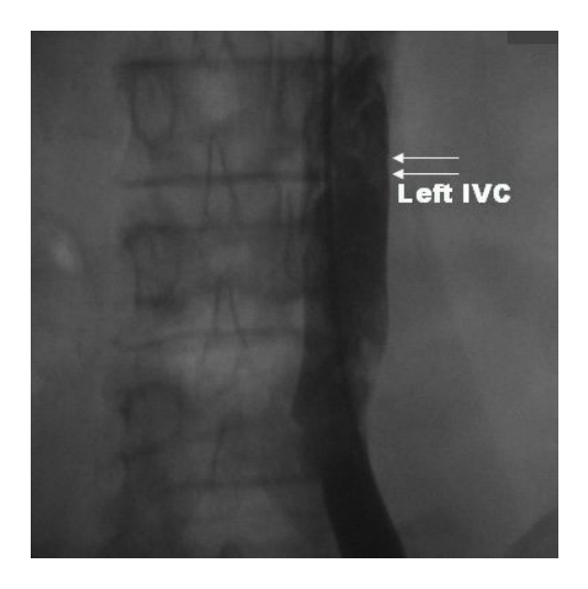
Figure 1: Fluoroscopy in the posterior-anterior view with contrast injection from left femoral vein shows Inferior vena cava (IVC) on the left side of the spine indicating a Left sided IVC.