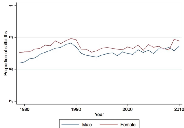
Figure 2. Annual trend in proportion of stillbirths by sex, 1979–2010.