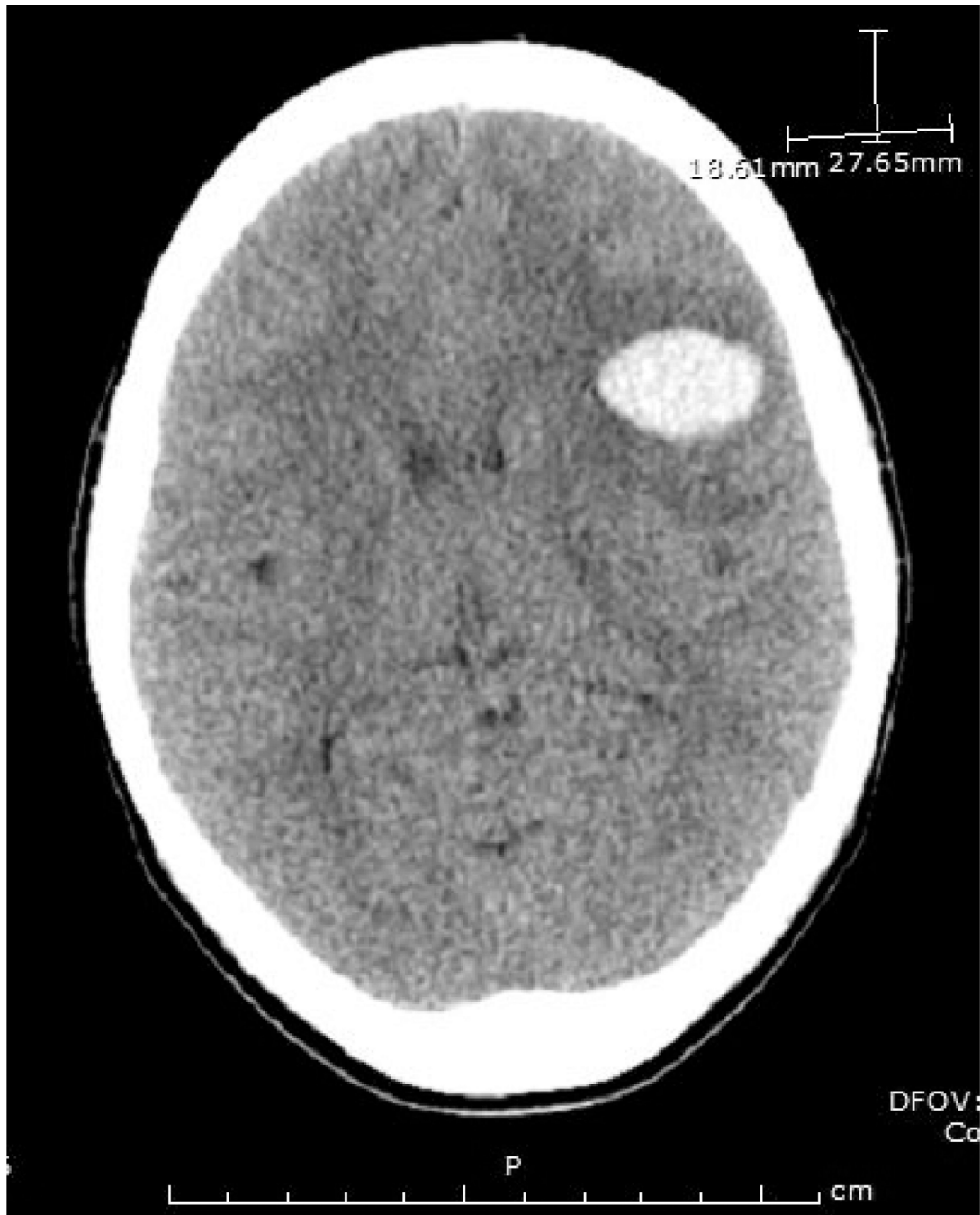
Figure 1. Emergent head CT demonstrating the larger of two frontoparietal hemorrhages.