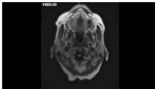
VIDEO 1: CT head and Brain MRI

She had a CT head without contrast, which revealed no evidence of acute pathology. Subsequent brain MRI revealed only moderate atrophy and periventricular microvascular ischemic changes (Video 1). The patient's family members who have been caring for her have been ensuring that the patient had been taking her prescribed medications routinely and correctly. She was given her home dose Levothyroxine 150mcg in the Emergency Department and admission was requested for lethargy and weakness in the setting of her stroke history. Given negative brain MRI, the patient's lethargy, weakness, and decreased appetite these symptoms are likely due to her hypothyroidism.