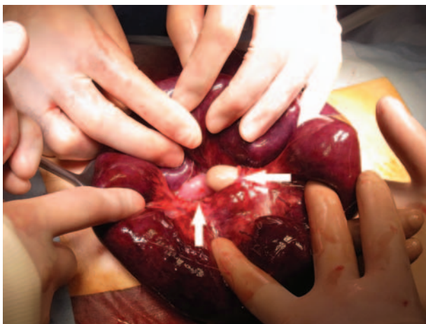
Figure 2: Intraoperative finding showing necrotic small intestines and a mesenteric defect (arrows) in the jejunal region.

Adult congenital mesenteric defect causing small bowel obstruction has been documented in only a few reports: five reports describing six patients in the past [1–5]. Only one patient was a man and six patients were women. The age of patients ranged from 18 to 38 years. It is reported that a congenital mesenteric defect more frequently identified in the distal ileum. The defect was found during surgical operation in six patients, and in the remaining one patient at the time of an autopsy after unexpected death.