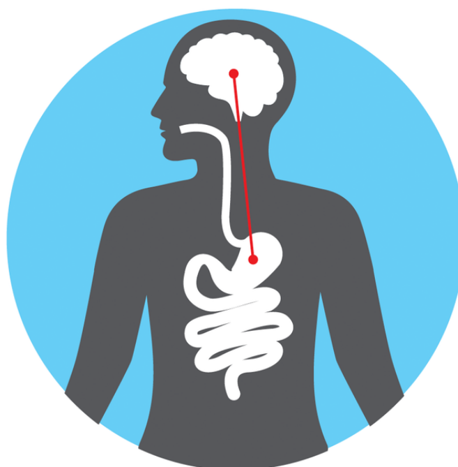
Figure 2. Graphic depicting brain-gut connection.