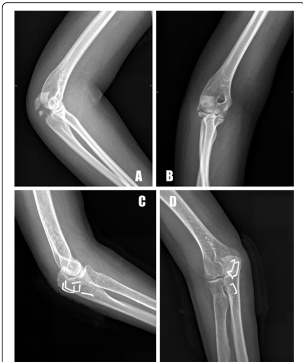
Fig. 5 A 55-year-old male patient with commuted olecranon fracture caused by a traffic accident (a, b). Fragments were reduced and fixed with the four ASCs. Eleven months after the surgery, the radiographs showed healed fractures, and the olecranon joint surface was anatomically reduced without any gap or step-off (c, d)

in this study is an industrial product into which the Ni-Ti shape-memory alloy is incorporated. The ASC has the biocompatibility and corrosion resistance superiority of the Nitinol shape memory alloy and can transform its shape with temperature changes, improving the