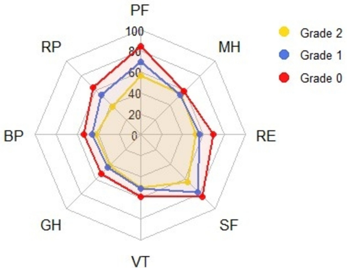
Fig 3. Spider plot of reported SF-36 domain scores by the grade of disability. PF- Physical Function, RP- Role limitations (physical), BP- Bodily Pain, GH- General Health, VT- Vitality, SF- Social Functioning, RE- Role limitations (emotional), MH- Mental Health.

https://doi.org/10.1371/journal.pntd.0009209.g003