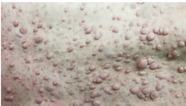
Figure 1. Multiple café-au-lait spots and neurofibromas were found in patient's back.

The admission physical examination showed stable vital signs (body temperature: 36.8°C; heart rate: 86 beats per minute; respiration rate: 19 breaths per minute; blood pressure: 91/50 mm Hg, 1 mm Hg = 1.33 KPa). No obvious abnormality was found in cardiac, lung, and abdominal examination. The patient was in consciousness and cooperative in answering questions. The bilateral pupils were sensitive to light reflection with equal shape and size. The bilateral eyes exhibited free movement. Multiple café-au-lait spots and neurofibromas were found over patient's chest, neck, back, and arms (Fig. 1). The shallow left nasolabial groove, drooping left eyelid and disappearance of forehead line were found in the patient's face. No hypoesthesia or hyperesthesia was found in the patient's face, body, and limbs. The myodynamia of left distant and proximate epipodite were