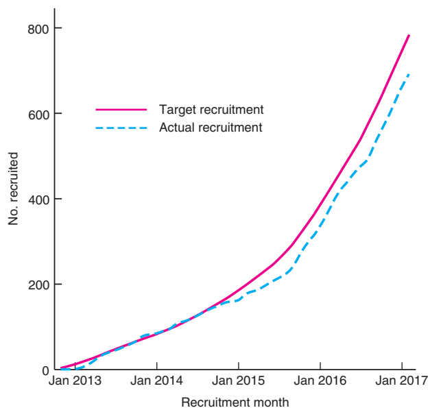
Fig. 2 Recruitment into the By-Band-Sleeve study at January 2017

forward. Each centre needed guidance on: when to collect data using the By-Band data collection forms and when to collect data using the revised By-Band-Sleeve forms; when to start using the revised patient information leaflets; and when the randomization system and database would be switched over and how to manage participants who had given consent but had not been randomized at the time of the switch ( Table 3 ).