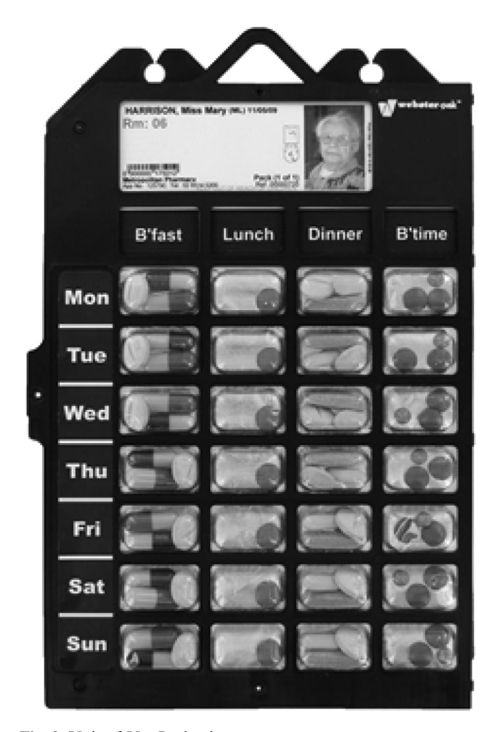
Fig. 2. Unit-of-Use Packaging.

UC consisted primarily of treatment in VA outpatient mental health clinics and included psychiatrist visits, non-MD mental health visits, and group visits. During the