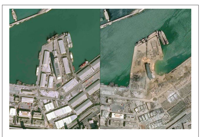
FIGURE 3 | Satellite picture for the Beirut explosion (before and after).

Some or combinations of these injuring mechanisms were experienced by the blast victims. For further information, please refer to the CDC application (https://apps.apple.com/us/app/cdc-blast-injury/id890434999).