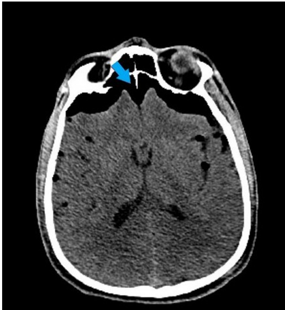
FIGURE 1: Noncontrast head CT through the frontal sinuses demonstrates the “Mount Fuji sign” of tension pneumocephalus (blue arrow).