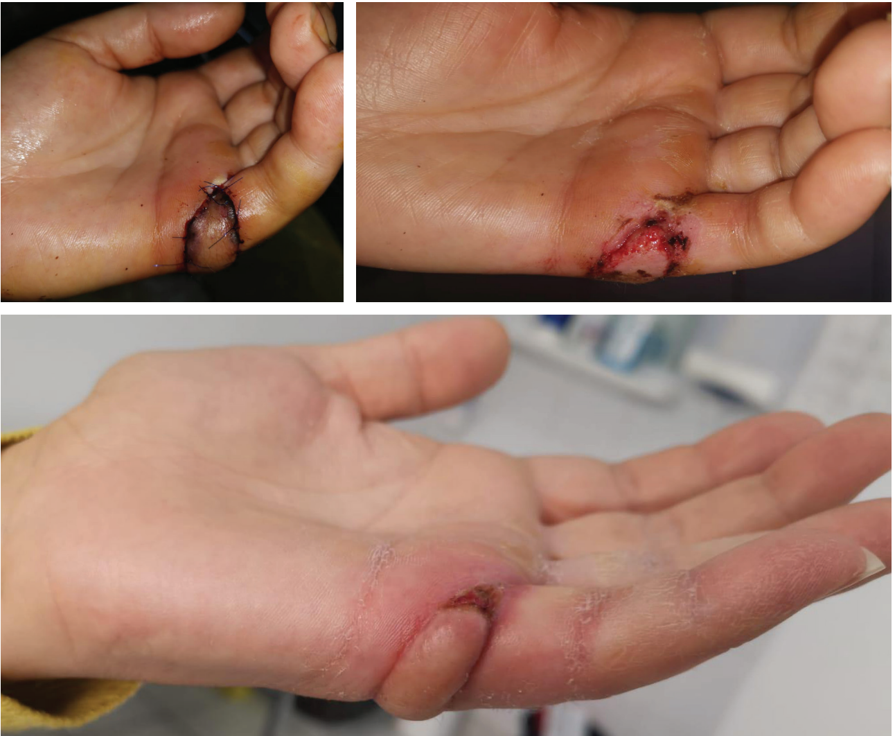
Figure 5. Case 2 – Postoperative aspect and after 20 days.