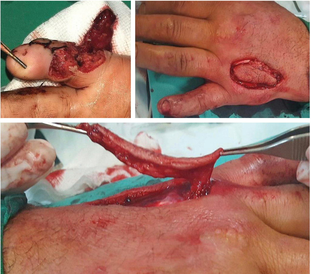
Figure 2. Case 1 – Defect and Quaba flap elevation.