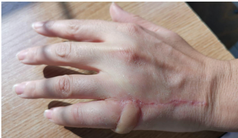
Figure 6. Case 2 – Postoperative aspect after 3 weeks.