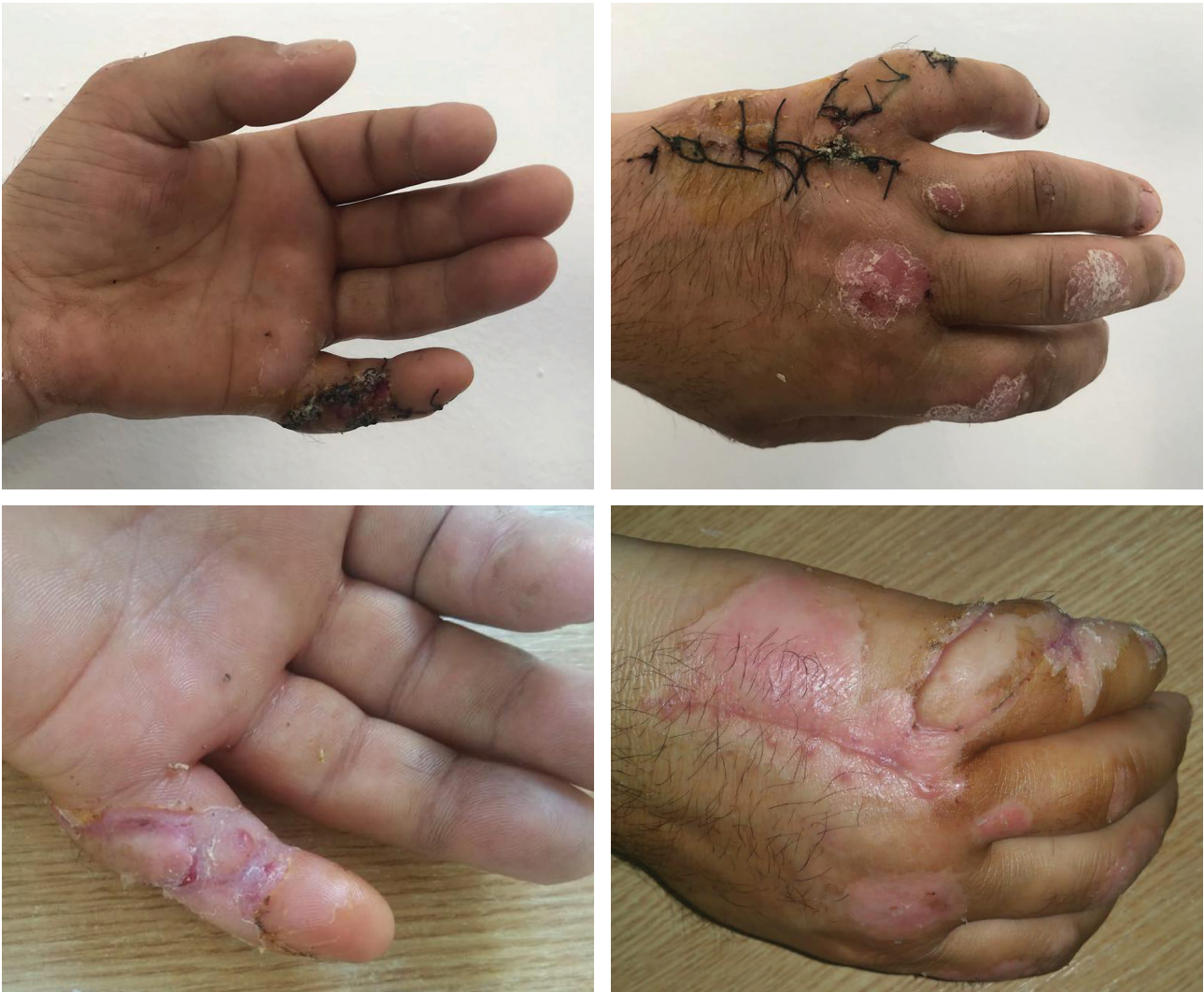
Figure 4. Case 1 – Postoperative aspect after 2 and 3 weeks.

local perforator flap, with minimal donor site morbidity, with a simple and straightforward rising technique [7, 8]. The palmar and the dorsal metacarpal artery system anastomoses distally, where it branches out a perforator, known as the Quaba perforator, that supplies the hand dorsum [4, 9]. As a constant palmar-dorsal small size vessel, this Quaba perforator, arising from the digital web space, is used in the flap with the same name [10]. Using vascular Doppler investigation to find the perforator is unnecessary, as the anatomy is quite constant and reliable: the perforator is located distal to juncturae tendinea, at the 2 nd , 3 rd , and 4 th interdigital space, at 0.5–1cm proximal to the metacarpophalangeal joint [2, 11].