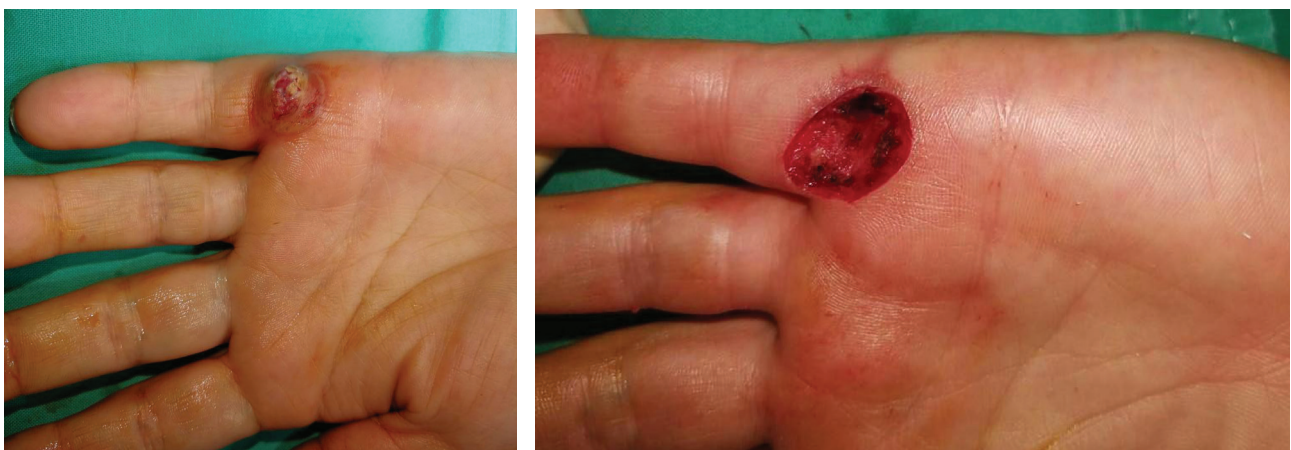
Figure 1. Case 2 – Before and after excision.

In the surgical treatment of such defects, the main goal is to successfully cover underlying structures, such as tendons, nerves, arteries, and/or bones, and, if the case, to reconstruct the flexion creases, providing a good functional outcome. The Quaba flap is an easy-to-use