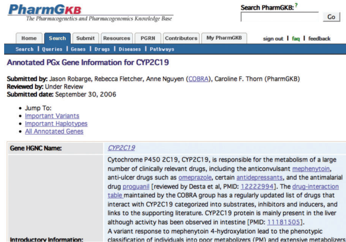
Figure 3. PharmGKB very important pharmacogenomic (VIP) genes: PharmGKB gathers knowledge on key pharmacogenomic genes, which highlight important variants, haplotypes, drugs, diseases and phenotypes associated with the gene.