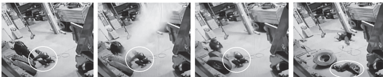
Figure 1 - Screenshots captured from the video surveillance system recording of the garage. The circled man is directly hit by the explosion, with a resulting cervical hyperextension causing a left internal carotid artery dissection; his colleague falls to the ground, suffering minor injuries to a hand

An echocolor Doppler study of the carotid artery was also performed but didn't show any morphological changes consistent with a dissection in the examined segment of the vessel.