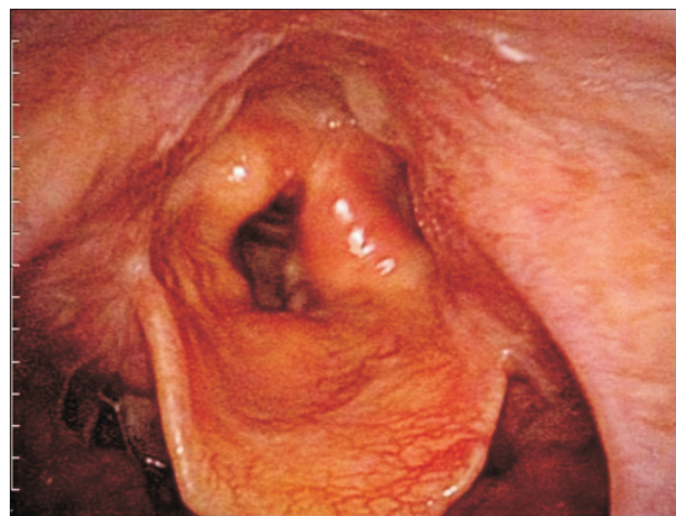
Fig. 2. Fiberoptic laryngoscopy during phonation shows a hypomobile vocal fold complex and incomplete glottic closure.