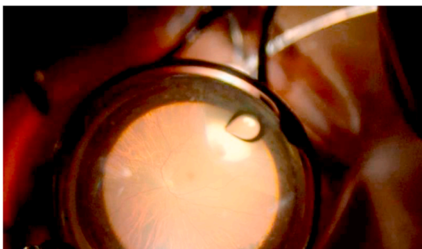
Fig. 3. A case of RRD associated with retinoschisis while performing cryotherapy to the break at 8 o'clock and old laser scars at the edge of retinoschisis were performed are seen superiorly as seen in the heads up display.