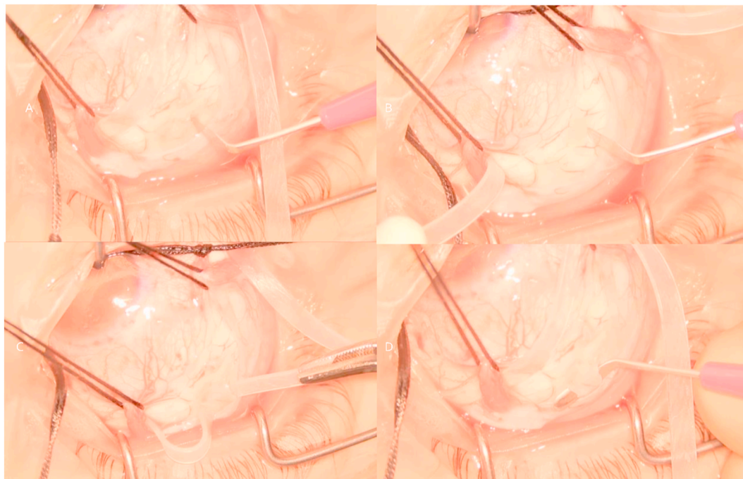
Fig. 1. A and B: Right eye partial thickness scleral wound was created with crescent knife. C: Crescent knife was passed through the partial thickness scleral “belt-loop” tunnels. D: 240 style scleral band passed through the tunnel.