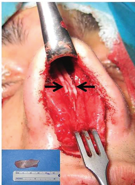
Fig. 1: Spreader grafts obtained from nasal septal cartilage (small figure) was placed symmetrically and bilaterally along the dorsal edge of the remaining septal cartilage (black arrows).

Septal cartilage was harvested, leaving a 10-mm L-shaped strut for nasal support. Two rectangular strips of cartilage were removed from the septum for use as spreader grafts and placed symmetrically and bilaterally along the dorsal edge of the remaining septal cartilage (Figure 1). All patients underwent surgery by the same surgeon using general anesthesia. Internal nasal splint or nasal packing was inserted at the end of the operation and removed 2 days after surgery. There were no serious complications in the postoperative period.