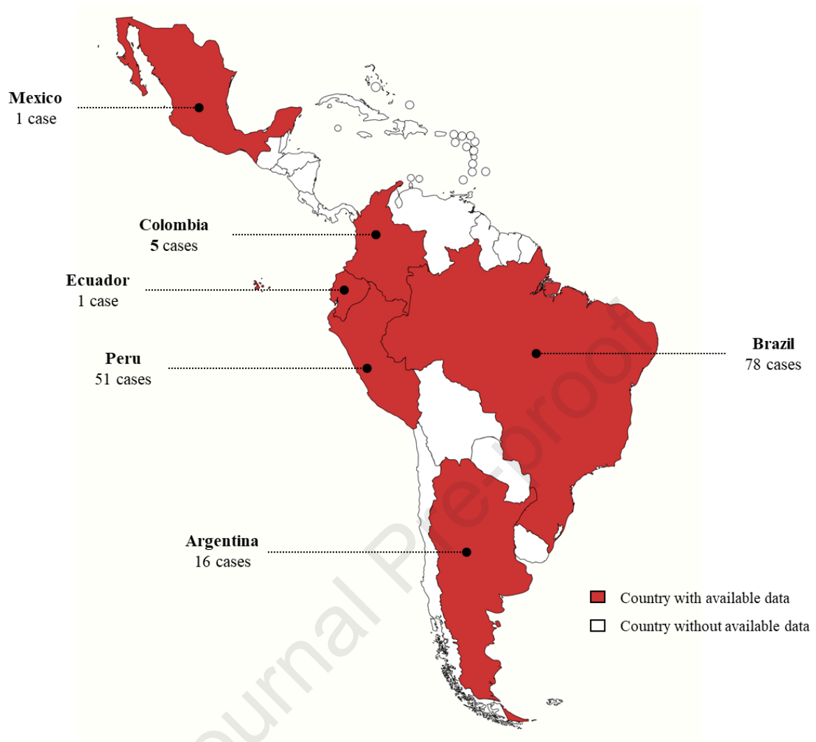
Figure 2. Cases of co-infection between COVID-19 and dengue in Latin America. Only coinfection cases from Latin American countries reported in selected studies were included.