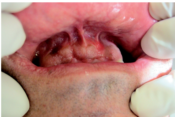
Fig. 1. Histological images of the pyogenic granuloma showing an appearance similar to granulation tissue. The histological type of the pyogenic granuloma is non-lobular capillary hemangioma. Arrow heads label blood vessels surrounded by connective tissue.

Lesions may occur as isolated or multiple, planned or raised, with well defined or diffuse edges and the color ranges from dark brown to black. There have been described multiple cases and others with bilateral lesion (Fig. 1). Melanoacanthoma lesions can be asymptomatic or develop with pain, burning or itching. Its etiology is related to irritative or traumatic factors (5).