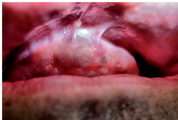
Fig. 2. Same lesion after a follow up of 10 years. It keeps stable.

The aim of the present article is to make a systematic review of all the published cases, as to actualize and evaluate etiologic factors and its clinicopathologic characteristics.