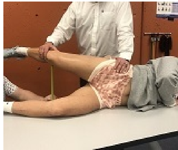
Figure 1: Ober's test

A baseline Ober's test was performed upon entry to the laboratory on both testing days. Figure 1 displays Ober's test, as it was performed in this investigation. Subjects then completed the FR protocol or the control treatment. When performing the FR protocol using a high-density foam roller (Thera-Band®, Performance Health, Warrenville, IL, USA), subjects were instructed to roll the lateral portion of each thigh, from the greater trochanter to the lateral epicondyle of the knee. During FR, subjects were instructed to maintain a position that kept the lateral aspect of the thigh in contact