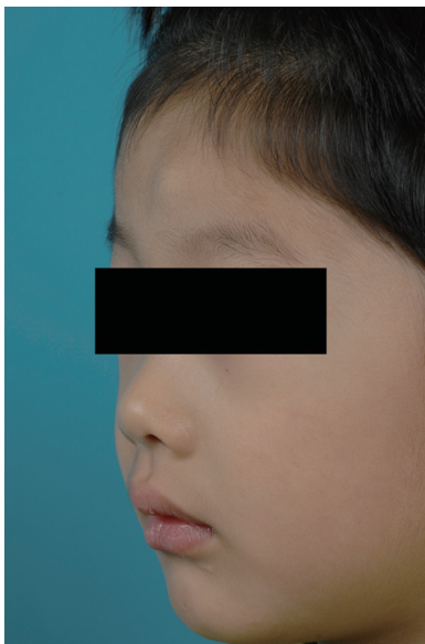
Fig. 1. Preoperative photograph showing bulging of the left forehead due to the mass.

Pathologically, the mass showed the characteristics of a leiomyoma, and a definite diagnosis was confirmed based on the immunohistochemistry showing desmin