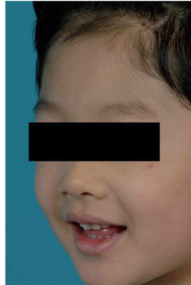
Fig. 5. Follow-up photograph at 10 days postoperatively.