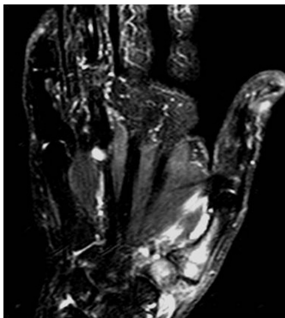
Figure 1 Coronal short time inversion recovery scan shows edema in trapezium and the first metacarpal bone. Repetition time/2,500 ms, echo time/60 ms, inversion time/160 ms.

erosions areas of irregular bone contours or ligamentous attachments [24]. The study was approved by the Institutional Review Board, and written informed consent was obtained from all subjects.