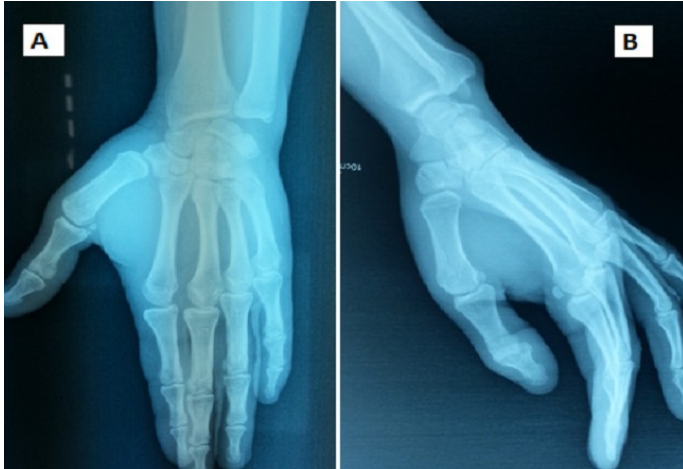
Figure 3: 6-month follow-up: Reduction maintained. (A) AP view and (B) pronation view