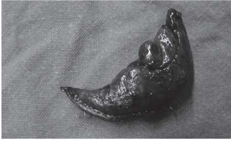
FIGURE 3: Resected bullae.

manipulation were associated with poor outcome such as death or serious brain injury [1]. However, the absence of any predisposing factor, like vigorous airway instrumentation, ventilator malfunction, or central venous catheterization, made the diagnosis more challenging regarding acute profound intraoperative hypoxemia.