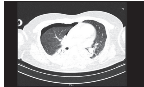
FIGURE 2: CT in the thorax showing right hemothorax and pneumothorax.

haemorrhagic fluid and improvement of hemodynamics (BP: 95 mmHg, HR: 88 bpm) and SpO 2 : 92%. Chest X-ray confirmed the diagnosis of pneumothorax (Figure 1). A thoracostomy tube was inserted with further improvement of oxygenation and drainage of 100 ml haemorrhagic fluid. The operation was postponed and the patient was transferred to the CT-suite, under sedation and controlled ventilation. CT scan revealed haemothorax and pneumothorax to the right hemithorax (Figure 2), perihepatic fluid collection, and fluid in the Morrison's pouch. Moreover, the diagnosis of multiple bullae was posed. The patient returned to the Postanesthesia Care Unit under sedation. ABG analysis was satisfactory (pH=7.35, PO 2 =123 mmHg with FiO 2 =0.5, and pCO 2 =38 mmHg). Hence, recovery from sedation and extubation was decided, which was uneventful. The patient was discharged a few days later. After investigation for pulmonary cystic disease, the patient underwent two stages of bilateral thoracotomy for partial parietal pleurectomy, lung apicectomy, and bullectomy, during the next few months (Figure 3). One year later she underwent total thyroidectomy for multinodular goiter without any perioperative complications.