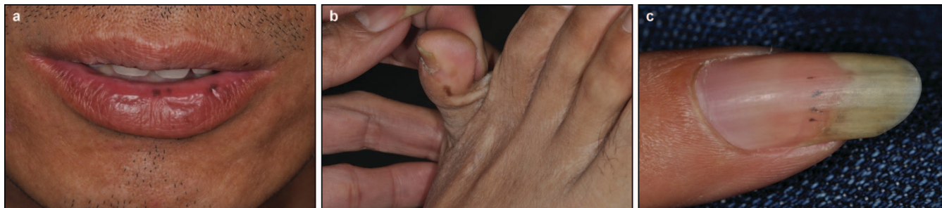
Figure 4 Clinical photographs in case 3. Multiple, round- to ovoid-shaped, blackish macules were present on his lips (a). A brownish macule was observed on the interdigital area of the left little toe (b). Some irregularly shaped or stippled pigmentation was noted on parts of his fingernails (c).