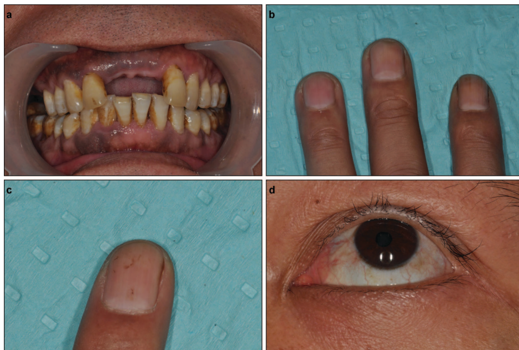
Figure 3 Clinical photographs in case 2. Extensively diffuse pigmentation distributed over the upper and lower gums (a). A single longitudinal pigmented band or multiple longitudinal pigmented bands were present on parts of the fingernails (b). There was irregular or stippled pigmentation on the nail of index finger (c). An ill-defined 3 mm×2 mm brown macule was noted in the inferior temporal quadrant of the left conjunctiva (d).