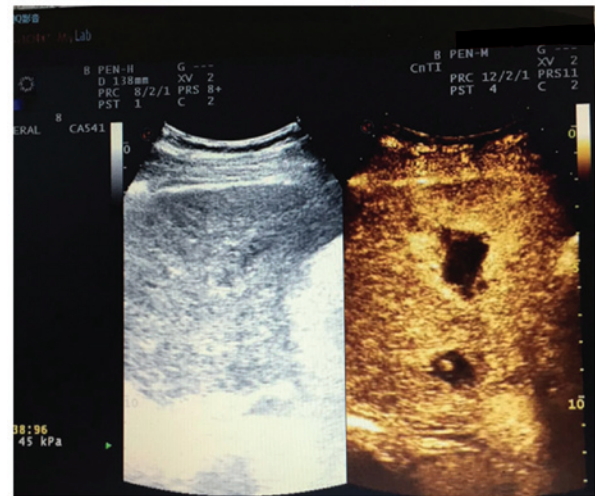
Figure 2. Contrast-enhanced ultrasound image for small hepatocellular carcinoma after treatment in the radiofrequency group.

third and fifth year were 91.1, 72.8 and 57.5%, respectively. The difference between the two groups was not statistically significant (Fig. 3).