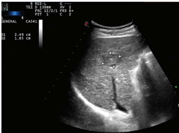
Figure 1. Contrast-enhanced ultrasound image for small hepatocellular carcinoma before treatment in the radiofrequency group.