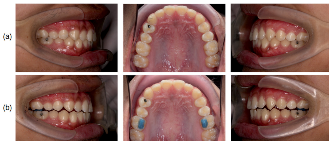
Figure 1- Intraoral photos (a) before and (b) after temporary bite-raising with light-cured orthodontic band cement

We performed two experimental sessions as