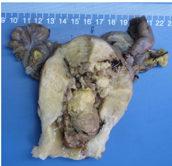
Figure 1 Gross image of the uterus and tumor.

The patient underwent cytoreductive surgery, including total abdominal hysterectomy, bilateral salpingo-oophorectomy with pelvic lymphadenectomy, omentectomy, appendectomy, partial sigmoidectomy with anastomosis, and resection of abdominal and pelvic metastases, without residual visible metastases. The uterus measured 10 \times 8 \times 5 cm and the cavity was filled with a cauliflower-like tumor measuring 6 \times 3 \times 2.5 cm and containing areas of ulceration (see Figure 1). This solid tumor had a grayish-white cut surface and moderate texture. Histopathologic examination of the uterine tumor revealed well to moderately differentiated