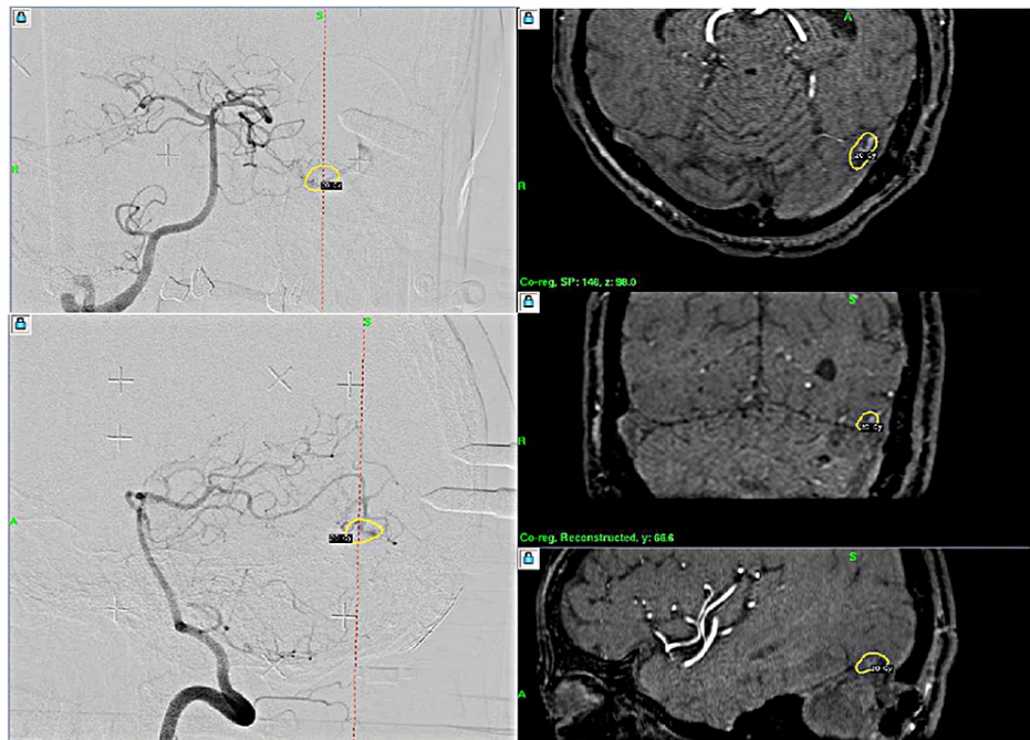
FIGURE 4: Gamma Knife radiosurgery for arteriovenous malformation.

The nidus of arteriovenous malformation (AVM) just above the tentorium was treated by stereotactic radiosurgery with a marginal dose of 20 Gy. Shunting flow of the AVM looked less remarkable when compared with the preoperative angiography.