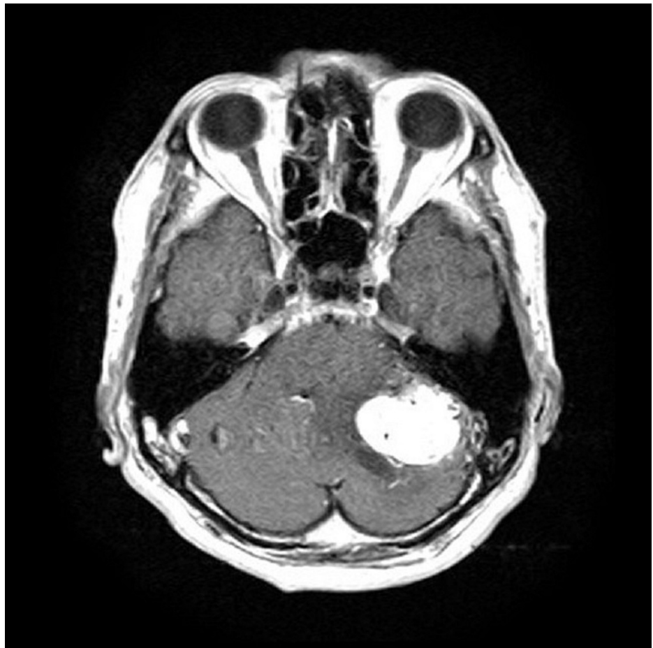
FIGURE 1: Magnetic resonance imaging (MRI) on admission.

Gadolinium (Gd)-enhanced T1-weighted MRI showed a large tumor in the left cerebello-pontine angle.