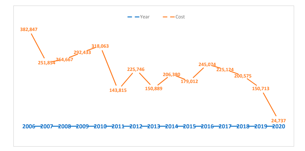
Figure 1. Economical trend related to varicella hospitalization cost (EUR).

Considering yearly costs, we observed an AHC reduction from EUR 382,847 in 2006 to EUR 24,737 in 2020. The economic trend in AHC is summarized in Figure 1. This is in line with the decreased yearly varicella hospitalization at Bambino Gesù Children Hospital.