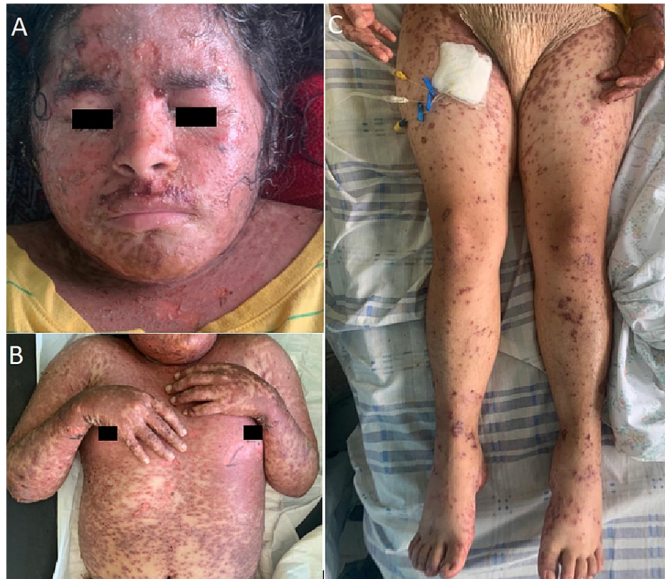
FIGURE 1: Anterior head, trunk, and legs on admission

Supportive treatment, including analgesia and fluid resuscitation, was promptly started alongside methylprednisolone, diphenhydramine, ophthalmic prednisone, and ceftriaxone 2 g IV daily. Prophylactic anti-tetanus immunoglobulin was also administered. On day 3 of admission, she had worsening of the lesions on her neck and hands. The lesions had active purulent oozing and showed increasing sloughing. The lesions were treated with topical silver sulfadiazine and topical gentamicin. The mean arterial blood pressure dropped below 60 mm Hg. As a consequence, antibiotics were escalated to imipenem and vancomycin. In the following days, she showed clinical improvement with an appropriate response to treatment. Methylprednisolone was changed to oral prednisone, the urine and blood cultures were both negative after five days, and a repeat blood count showed 5,590 leukocytes/mm 3 , C-reactive protein improved to 14 mg/dl, and the rest of the complete metabolic panel was within normal limits. Fifteen days after the initial presentation, the skin lesions had re-epithelialized (Figure 3).