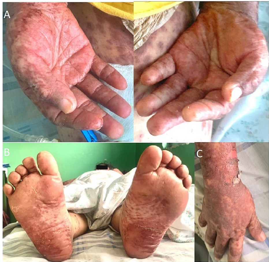
FIGURE 2: Hands, arms, and soles on admission

Positive Nikolsky's sign in the right arm at the level of the wrist is seen, along with palmar desquamation (A,C). Furthermore, acral lesions with edema, purpuric spots and peeling of the dermis in the plantar region were observed (C).