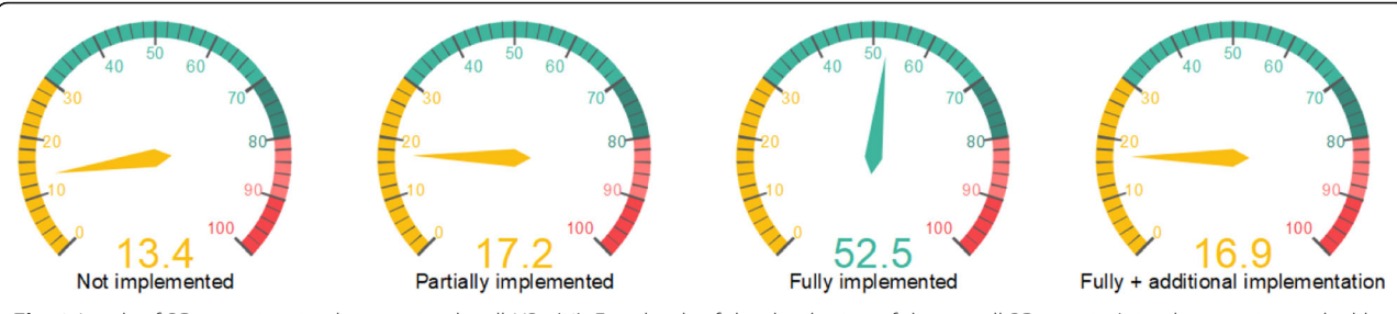
Fig. 2 Levels of PDs practices implementation by all HPs (%). Four levels of the distribution of the overall PD practice's implementation ranked by all the HPs after participating in the demonstration simulation are shown

Reay and Rankin [31] claim that, in contrast to other abstract theories, the RPD model takes into account dynamic and stressful situations such as those found in the medical field. In RPD Variation 3, a person knowledgeable about the situation must choose the optimal course of action. The decision-maker engages in mental simulation that entails testing different scenarios using the "if ... then ..." format. After testing a number of scenarios, the decision-maker chooses a course of action that appears appropriate to the goals and priorities of the situation. Since the RPD model is predicated on time constraints, the decision-maker chooses the first course of action that appears appropriate to the situation. Our proposed methodological model implements RPD Variation 3: Each of the demonstrators must undergo a process in which the topic of maintaining a hygienic environment moves from the peripheral route to the central route, in accordance with the Elaboration lLikelihood mModel [32].