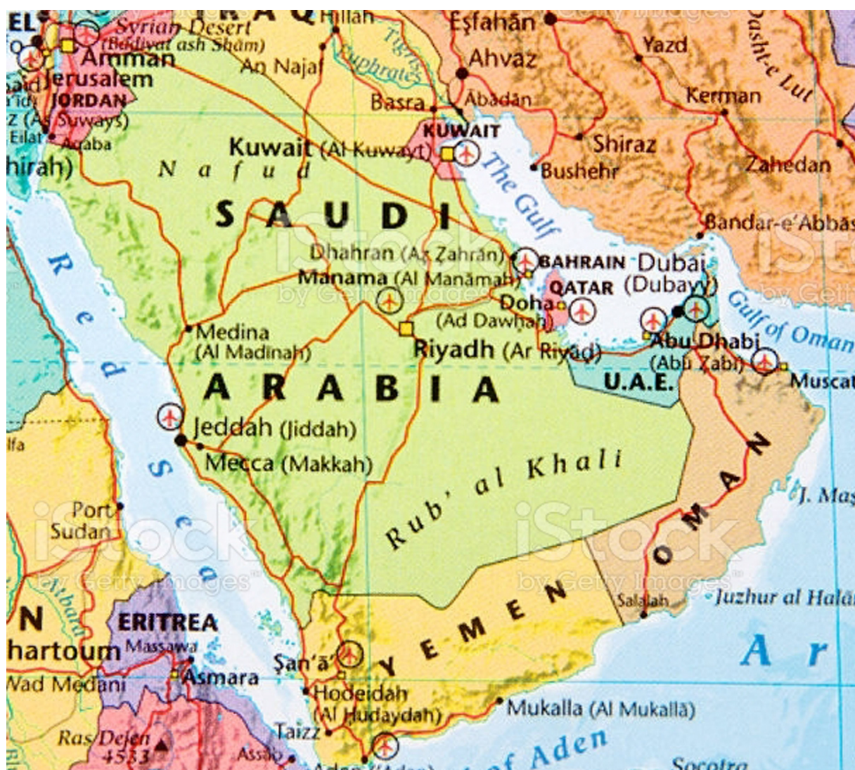
Fig. 1. Map of Saudi Arabia showing the geographical location. (Istockphoto, xxx).

To locate relevant material, we selected keywords such as herbs, plants, medicinal plants, skin, dermatological, topical, Saudi Arabia, Arabian Peninsula, and traditional medicine. These terms were searched in relevant databases, including Google Scholar, PubMed, and Scopus. We gathered data from research articles, review articles, book chapters, and conference abstracts published