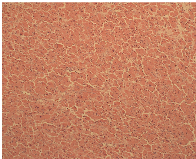
Figure 3. Histopathology section showing diffuse proliferation of oncocytes (Haematoxyline-eosin staining, magnification 200x).

of adrenocortical oncocytomas since the first description of this tumor in adrenal in 1986 17 . Most of the papers describe only single patient case reports.