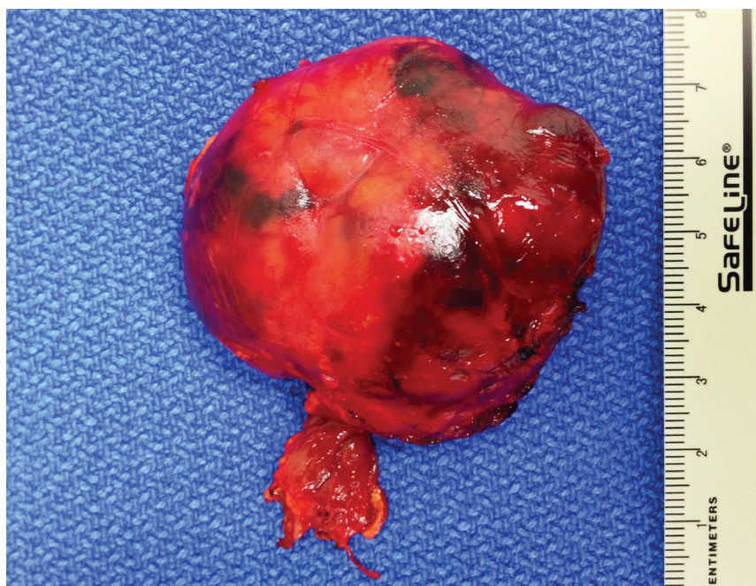
Figure 2. Specimen with adjacent part of left adrenal gland after retroperitoneoscopically performed tumor enucleation.