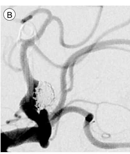
Fig. 2. (A) Aneurysm regrowth in the middle cerebral artery bifurcation. (B) Coil embolization for aneurysm regrowth.