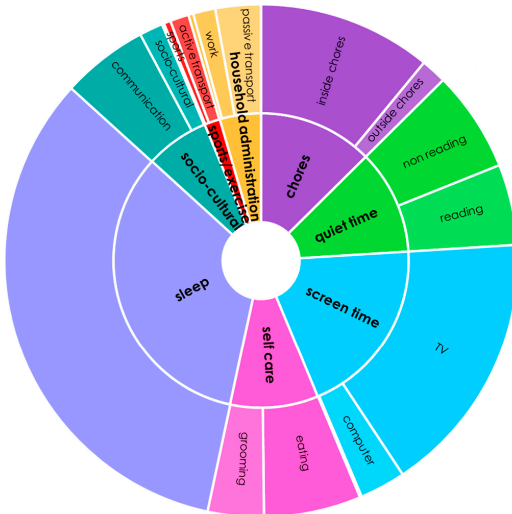
Figure 2. Composite activity profile presenting a typical profile of 24-h time use. Mean time spent in MARCA superdomains (in min/d) is presented using arithmetic means from baseline MARCA data.

All values are expressed as mean (SD) and represent time spent in each category in minutes per day (min/d). n = number.