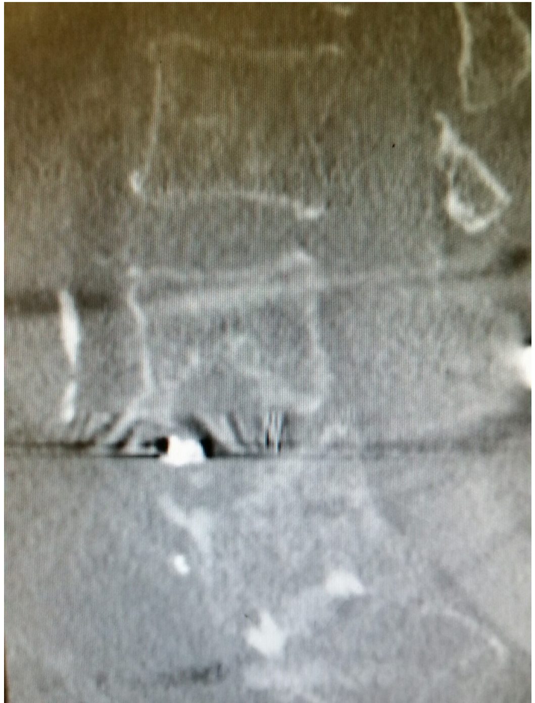
FIGURE 2: Sagittal CT reconstruction shows erosion of the endplates and rotation of the graft.

After careful review of all the findings, it was felt that a repeat laminectomy with an attempt to remove or replace the interbody graft posteriorly would be difficult, so the patient was offered an extreme lateral lumbar interbody fusion (XLIF) to approach the L4-5 space laterally, allowing both debridement and grafting. However, the patient refused this procedure. It was subsequently suggested that it might be possible to enter the disc space endoscopically, curette the area, and then place Cortoss®, a bioactive bone cement (Stryker®, Malvern, PA), around the graft to support the disc space. He was explained that if we could not debride and remove fibrous scar around the graft, it would be less likely the cement would be helpful. He agreed to