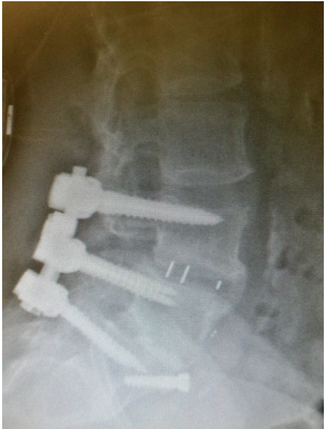
FIGURE 1: Lateral X-ray appears to show the graft in place; however, L4-5 is not fused.