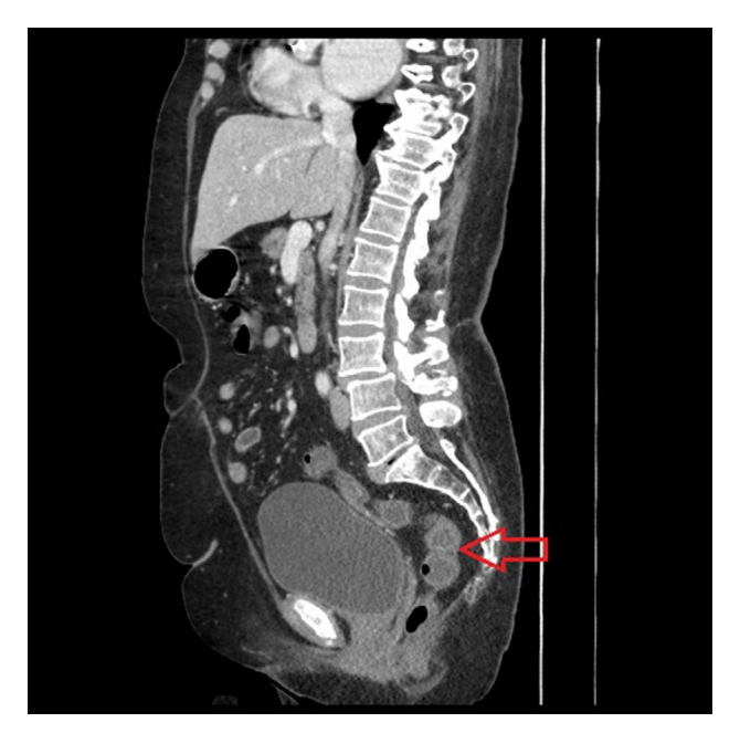
Figure 2 Sagittal view of computerized tomography scan of abdomen. Notes: The arrow shows mild circumferential enhancement and haziness of the wall of the distal sigmoid colon and rectum.

lead to hyper-infection if the patient is immuno-suppressed or misdiagnosed. Strongyloides hyper-infection has a high mortality rate which reaches 90% if left untreated. This was particularly true in our patient since her nutritional status was poor and we had to make the judgment call of using ivermectin. We suspect that this radiological sign is seen in patients who have had multiple S. stercoralis infections or a chronic infection. We also advocate the need for more studies of similar cases and an expanded classification of the disease of a localized colonic infection without signs of systemic infection.