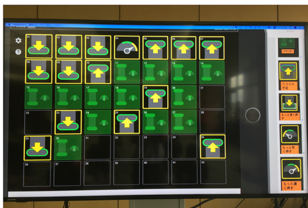
Figure 3 Image of actual display on the front screen.