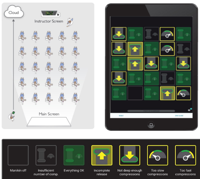
Figure 2 Image of Quality Cardiopulmonary Resuscitation-Classroom feedback system.

To measure the effect of CPR training, 1 min of chest compression was measured without any feedback given as a pretest. Similarly, 1 min of chest compression was also measured after the training as a post-test. Although 1 min of measurement may not be sufficient for CPR performance in real life, we focused on the initial CPR performance in a single-rescuer situation. A survey and baseline characteristics, such as weight, height and CPR training experience (table 1), were also collected after the post-training measurement. The metronome was set at 110 beats/min and used for every instance of hands-on practice during the QCPR Classroom session, but no metronome was used during the standard CPR training.