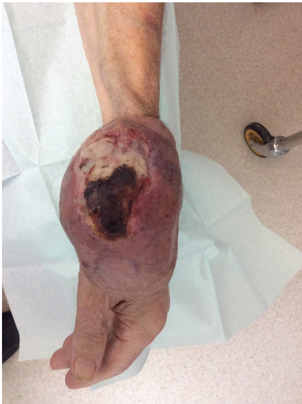
FIGURE 1: Left hand

Large tumor over the wrist joint with ulceration and bleeding (15 cm x 10 cm)