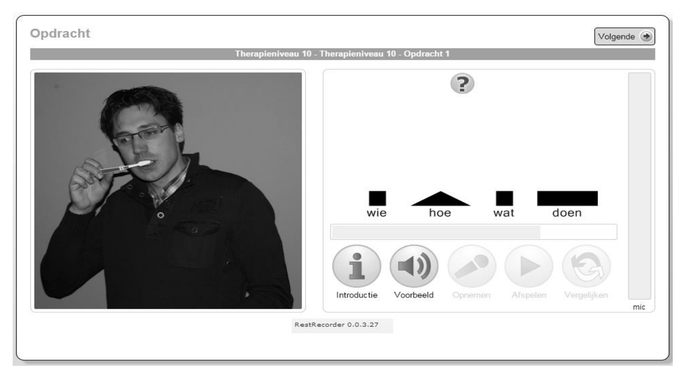
Figure 1. User interface of the first item of the tenth therapy level of e-REST when enrolled in the first therapy cycle. Target elliptical utterance: Paul zonder tandpasta tanden poetsen , 'Paul brushing teeth without toothpaste'. For an explanation of the buttons depicted in the interface see the text.

.mp3 format as a means to compress the audio recordings. The web-based therapy programme had two interfaces: one for the aphasic client (front end) and one for the SLP (back end).<sup>a</sup>