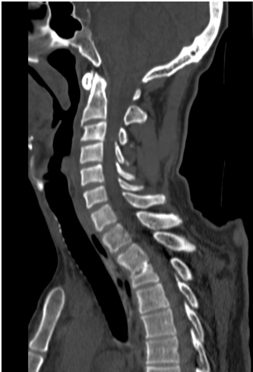
Fig. (1). Computed tomography of discussed patient showing the congenital narrowing of the spinal canal at the level of C3 and C4. Also, a preexisting injury at the level of T2 and T3 can be seen.

Patient A, a 57 year old mechanic with a medical history of occasional use of cocaine and of gradually worsening vision in the last five months as a result of optic nerve atrophy tripped over a low brick wall at work and fell about one meter on the back of his head. He was immediately found to be tetraplegic by the paramedics and was transferred to a level 1 trauma center. Clinically, the complete cord lesion was found to be on the level of C3 and C4. Computed tomography showed a congenital narrowing of the spinal canal at the level of C3 and C4 as well as an old fracture of the third thoracic vertebra (Fig. 1). Magnetic resonance scanning showed hemorrhage in the myelum at the level of C3 and C4 as the reason for the tetraplegia (Fig. 2).