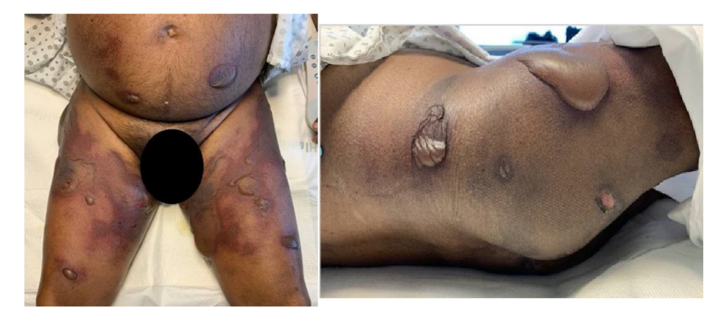
Fig. 1. The patient presented with multiple violaceous patches with the development of blisters on some patches.

face area (BSA), and toxic epidermal necrolysis (TEN), >30% BSA. Both involve bullae formation and sloughing of the skin [2]. EM, SJS, and TEN were rarely reported as a result of vaccination. Most cases were linked to childhood vaccination (combined measles, mumps, and rubella), DtaP, and varicella vaccination [4].